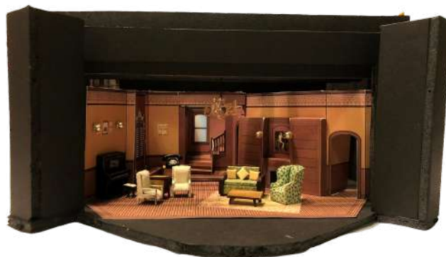
Left: A photo of Haylie's scenic design for Stage Door , Spring 2020 Right: The model of her scenic design