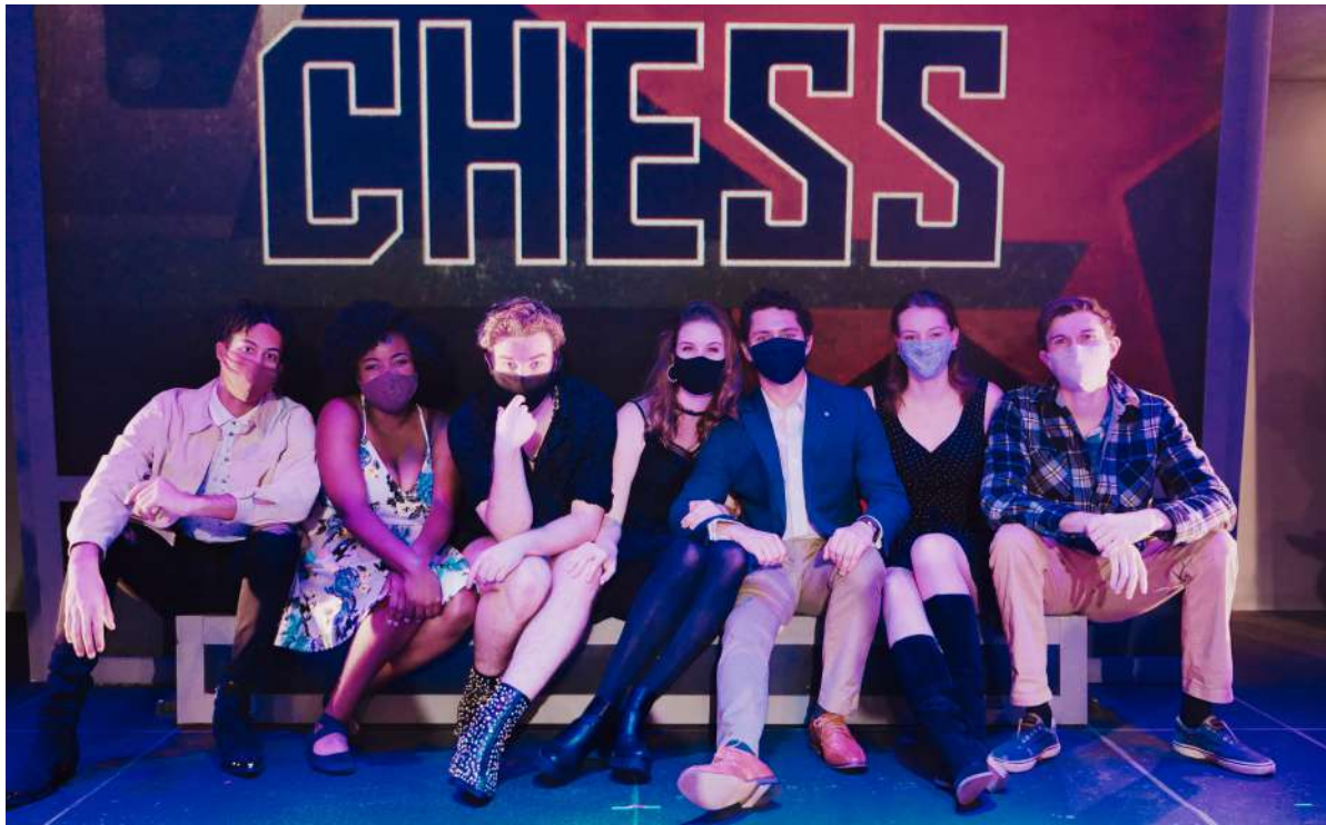
The Music Theatre Class of 2021 after the closing night of Chess