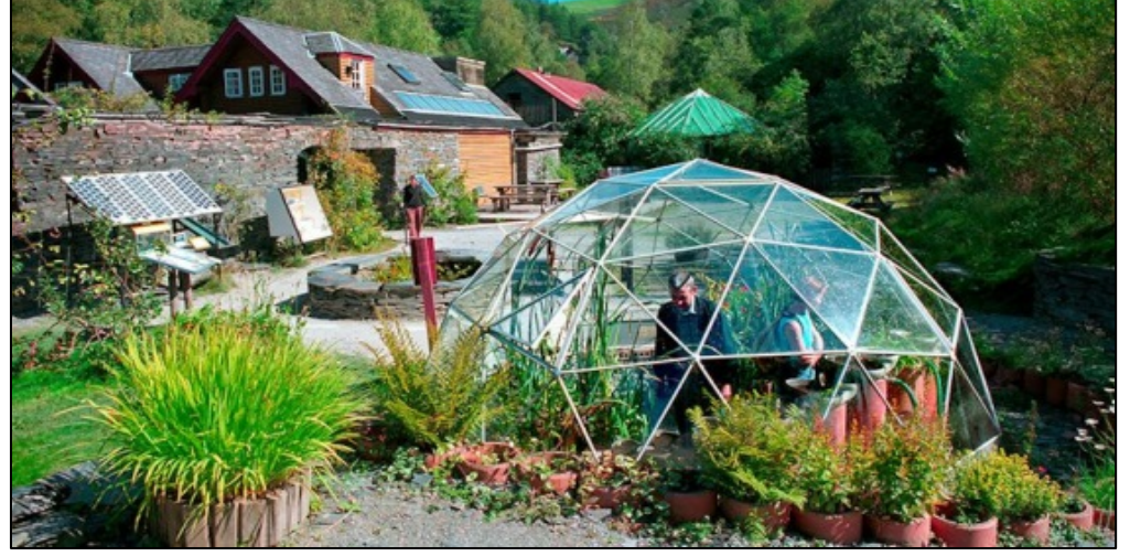
Center for Alternative Technology, Wales