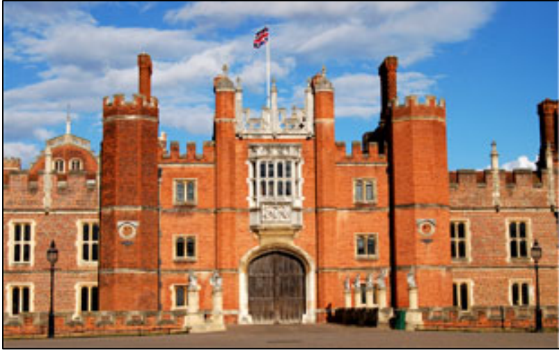
Hampton Court Palace