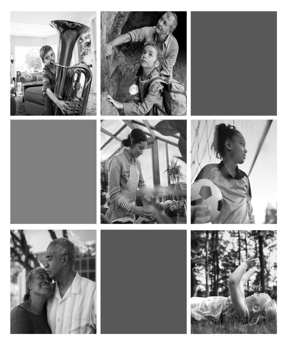
Your Health Care Benefits Program