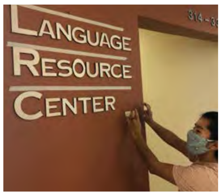
Aug: Welcome to the new LLC