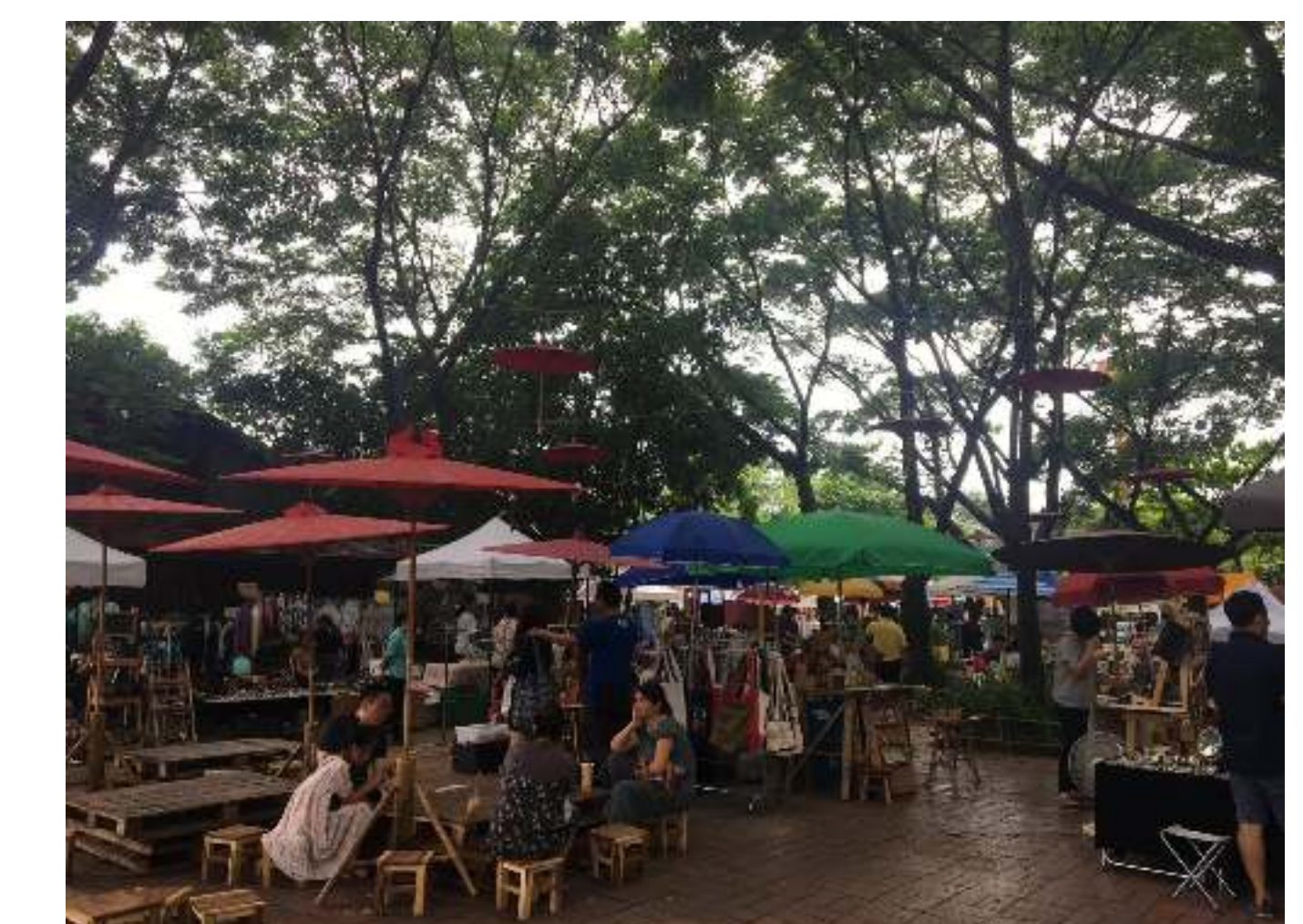
Tasted the Local Foods at Many Markets