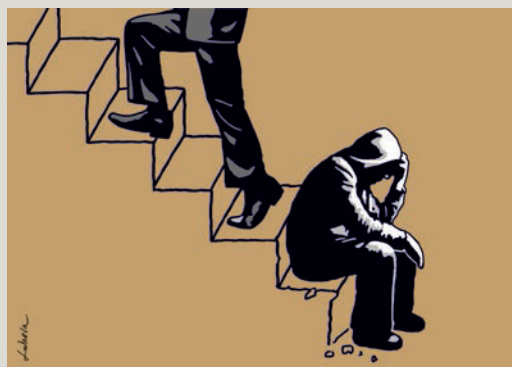
Luba Lukova; "Upward Mobility," 2016; silk-screen; Art © Luba Lukova