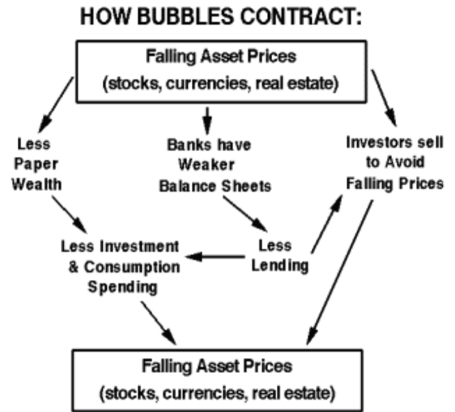
FIGURE 2 How Bubbles Contract

Note: This diagram also incorporates the effect that banks have on bubble contraction. Diagram is from CAW TCA Newsletter. December 1998 v4 n2.